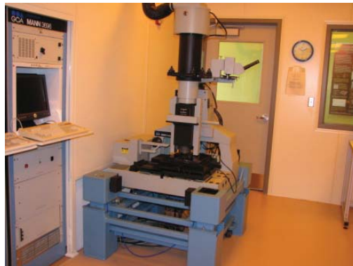
GCA 3696 PhotoRepeater