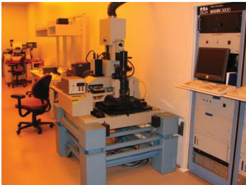
GCA 3600 Pattern Generator

Mask Making Suite: In-house mask making allows for more creativity and design flexibility at reduced cost